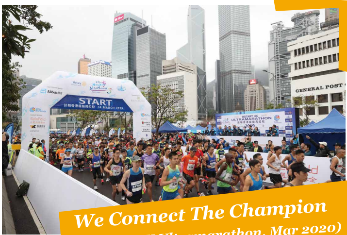
We Connect The Champion (Rotary HK Ultramarathon, Mar 2020)