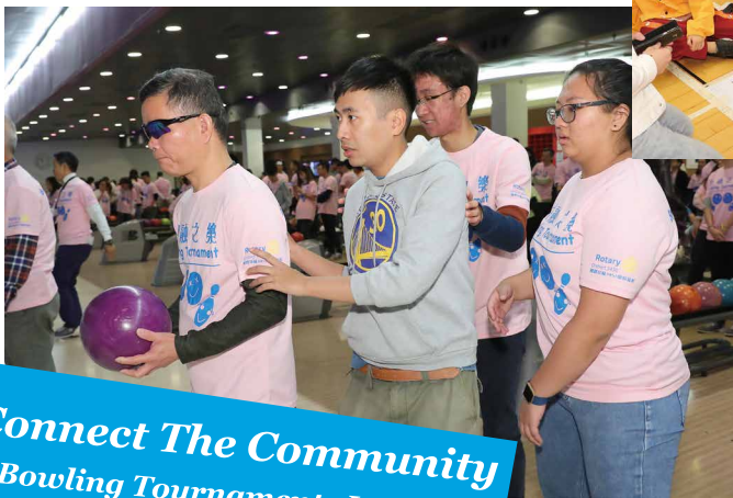
We Connect The Community (HK Blind Bowling Tournament, Jan 2020)