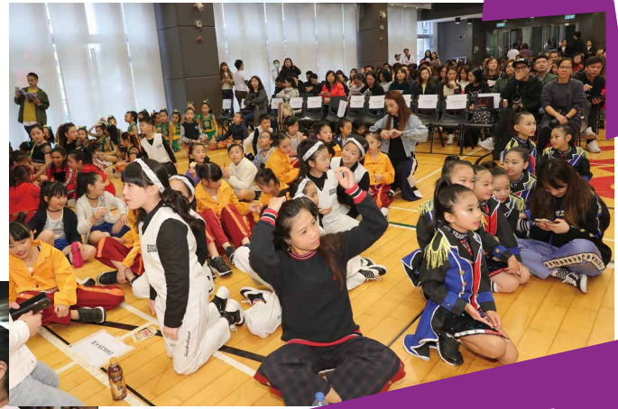
We Connect The Youth (Rookie Star Street Dance, Feb 2020)