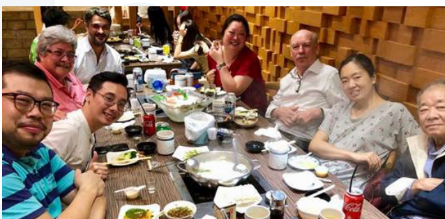
Club Fellowship at Japanese Restaurant after Membership Connect Forum