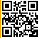
http://bit.ly/37dsQF4 Interview of Rotary Clubs of Kwun Tong and Peninsula Sunrise